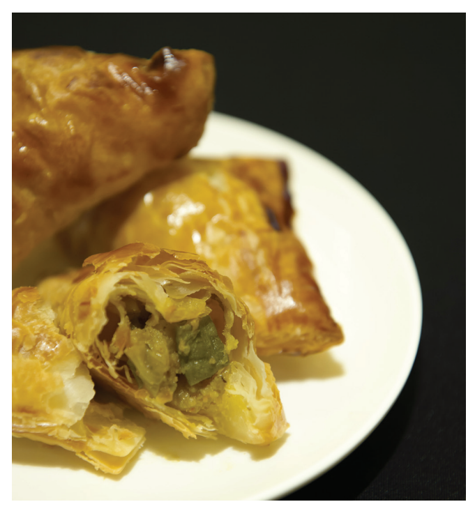
Vegetarian food items from the green Harvest Menu